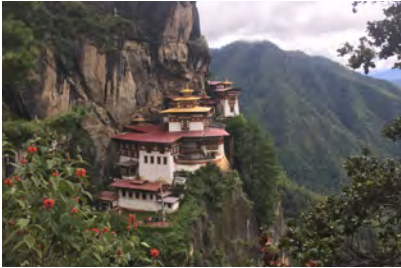
Tigers Nest (Taksang)