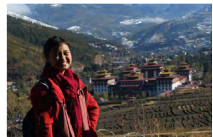
School Girl in Thimphu