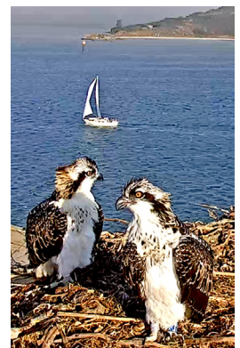
Osprey fledglings from our nest cam.

FULL PLAN: A full copy of the Strategic Plan, including a timeline, is available on our website at: goldengateaudubon.org/strategic-plan-2020-2023