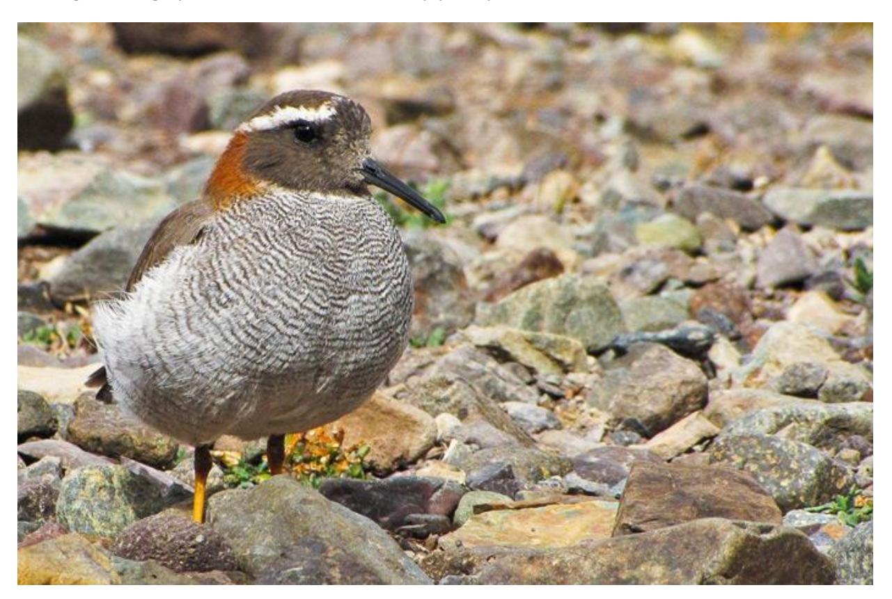
Day 3 • Sunday 23 January, 2022 • Drive to the Pacific coast: Maipo Estuary – Laguna El Peral Nature Reserve – Viña del Mar

Overnight Santiago (Breakfast, Picnic lunch, Dinner) (Guide).