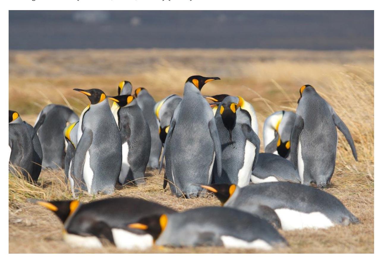
Day 13 • Wednesday 02 February, 2022 • Laguna Verde - Pali Aike road - Puerto Natales

Overnight Porvenir (Breakfast, Lunch, Dinner) (Guide).