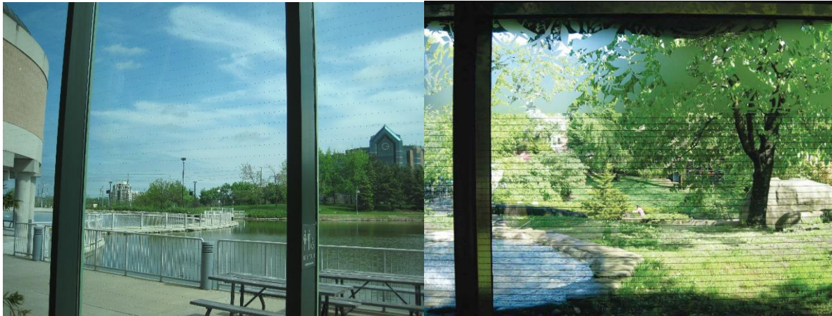
Markham, Ontario Civic Center